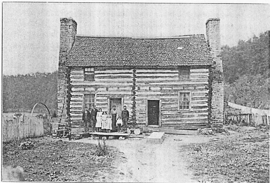
DWELLING HOUSE OF GEORGE CHAPMAN